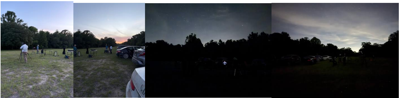
Braving the wilds: members of BRAS and LSU made an excursion to a local dark site despite the clouds.

This month's meeting will be focused on our Outreach team. We'll be showing off some of our kits, learning some new ones, and talking about the resources available to us through the Night Sky Network.